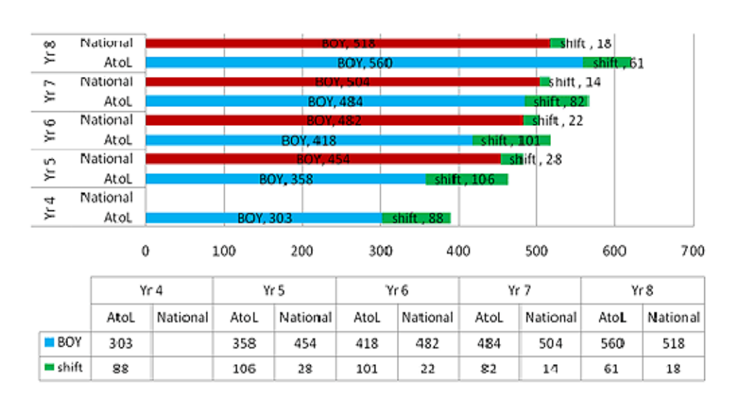
Graph 1: AtoL and national primary writing shifts (years 4-8)

Graph 1 compares the shift of the mean writing scores of AtoL students with national asTTle V4 shifts. The end of year (EOY) scores are the sum of the beginning of year (BOY) scores and the shift scores. The shift in the national data in each year represents the expected shift from the previous year.